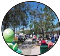
Festival on the Green