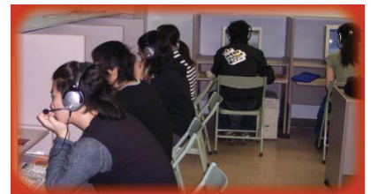
Students taking the TOEFL

For more information on the TOEFL or to register to take the TOEFL, please visit www.toefl.org .