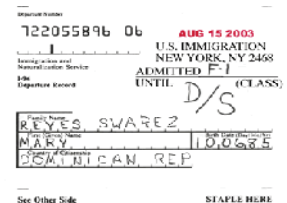
Sample I-94 card