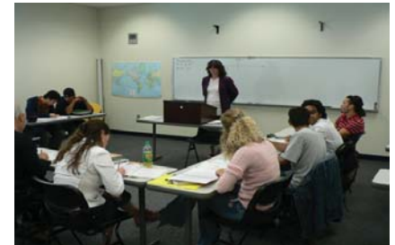
IEP Class Summer 2007

Students learn at their own pace after completing a placement test administered on the first day of class. The placement test will determine which of the five levels, from beginner to advanced, the student will study. The program is designed so students can easily advance from one level to another .