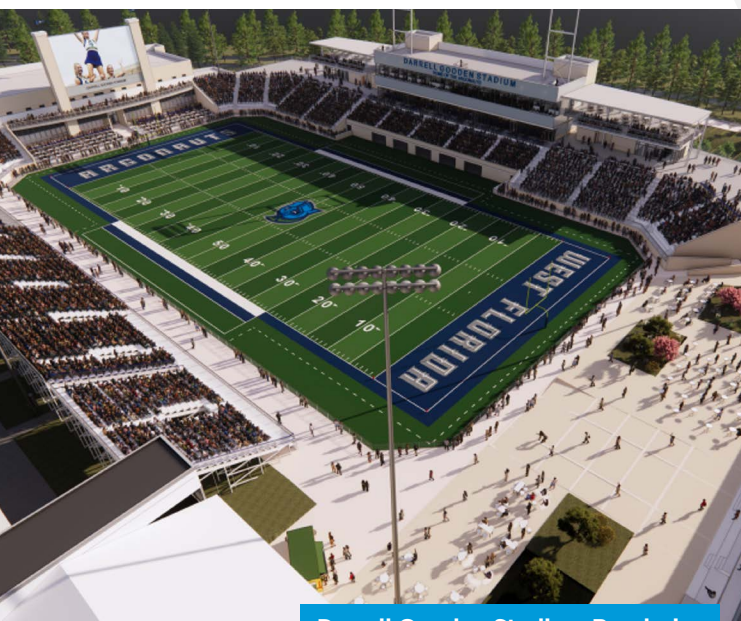
Darrell Gooden Stadium Rendering