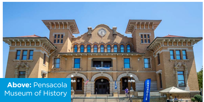
Above: Pensacola Museum of History Below: POP Mural at the Voices of Pensacola