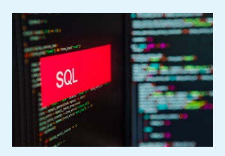
Start Dates: 1/17, 2/14, 3/13, 4/17, 5/15 6 Weeks/24 Course Hours | $129 Location: Online

SQL is one of the best programming languages for beginning web developers to learn. Gain a solid working knowledge of the most widely used database programming language. This course will provide you the skills to write SQL queries to create tables, retrieve data from single or multiple tables, manipulate data in a database, and gather statistics from data stored in a database.