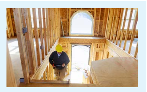
200 Course Hours | $2,495 #GES704 | Location: Online

This course is designed to educate candidates on cutting edge green building and sustainable design practices and enables participants to designate that expertise with an internationally recognized professional credential. Start Anytime 40 Course Hours | $695 #GES784 | Location: Online