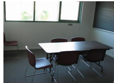
Current Group Study Room