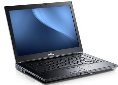
Dell E6410 Laptop

c. UWF Emerald Coast Library currently has three laptops available for students. Because we have so few, we currently do not allow overnight check-out and the laptops must be used in the library. This proposal would add 9 laptops that students will be able to use in the upgraded group study rooms, at open tables throughout the library and at home for overnight use - meeting students' needs for flexible, portable technology.