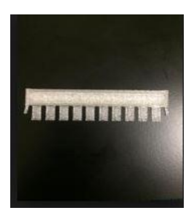
Cuneiform tablet for History student