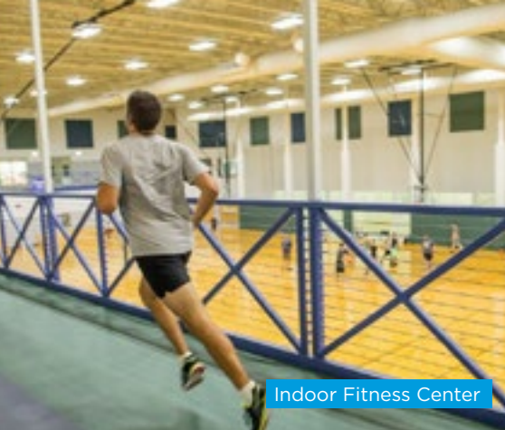
Indoor Fitness Center