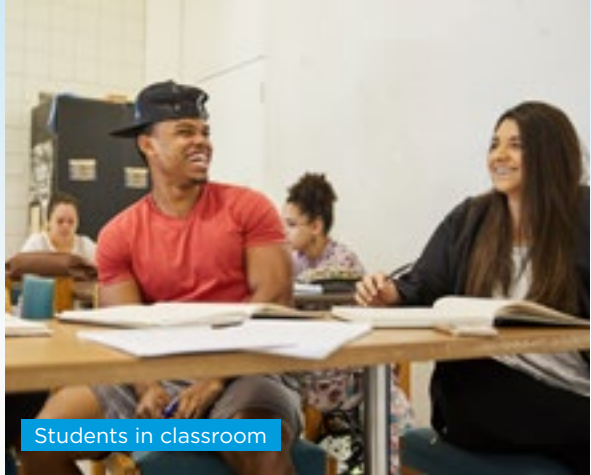
Students in classroom