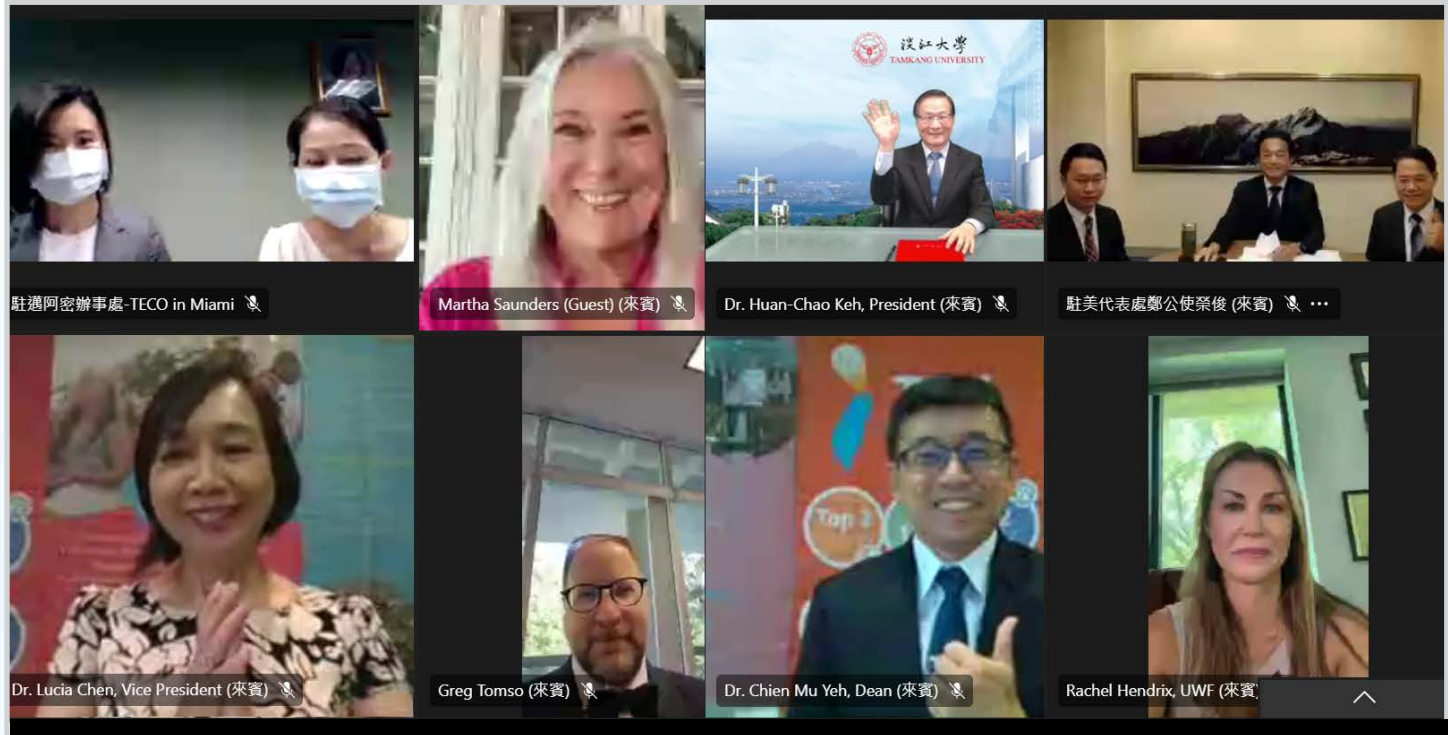
Signing of a Memorandum of Understanding to launch the Taiwan Huayu BEST Program