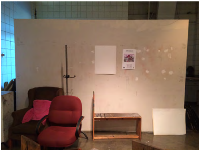
Room 242 Front Partial Wall

Images of the classrooms listed can be found below.