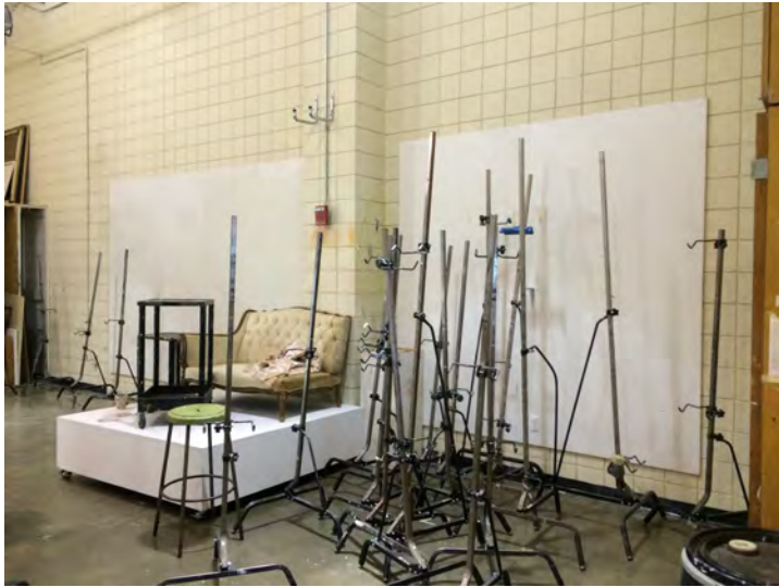
Room 241 Right Wall