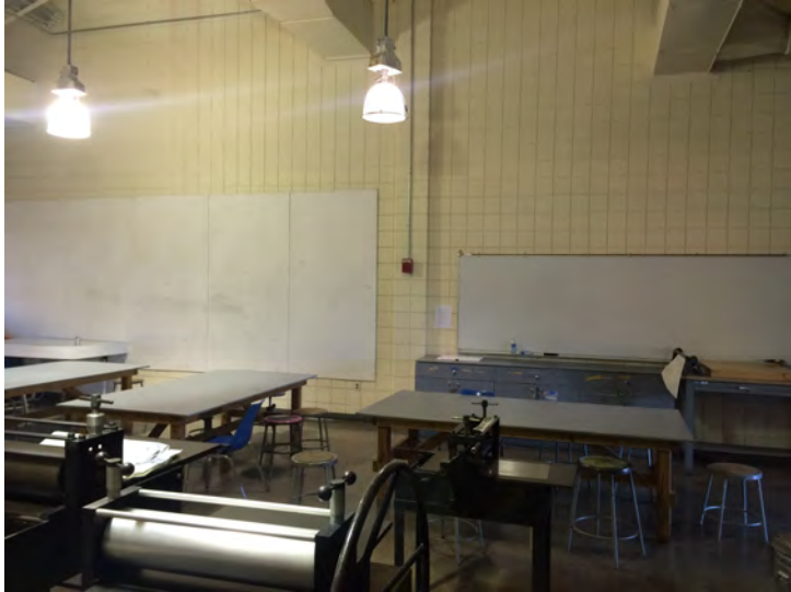
Room 243 Right Wall