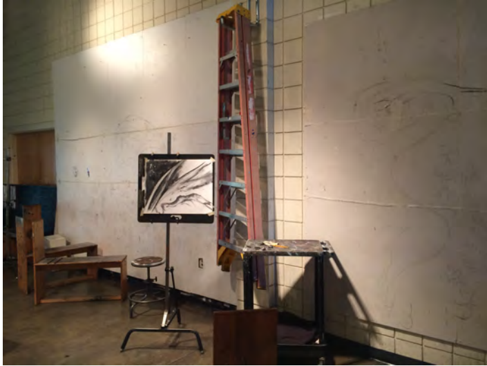
Room 242 Right Wall