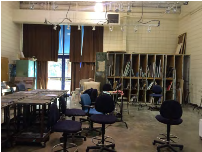
Room 241 Back Wall