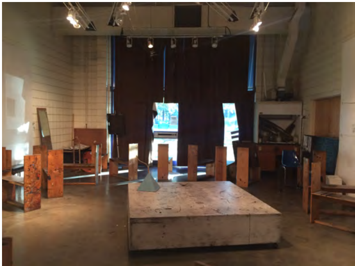
Room 242 Back Wall