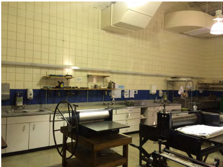
Room 243 Left Wall