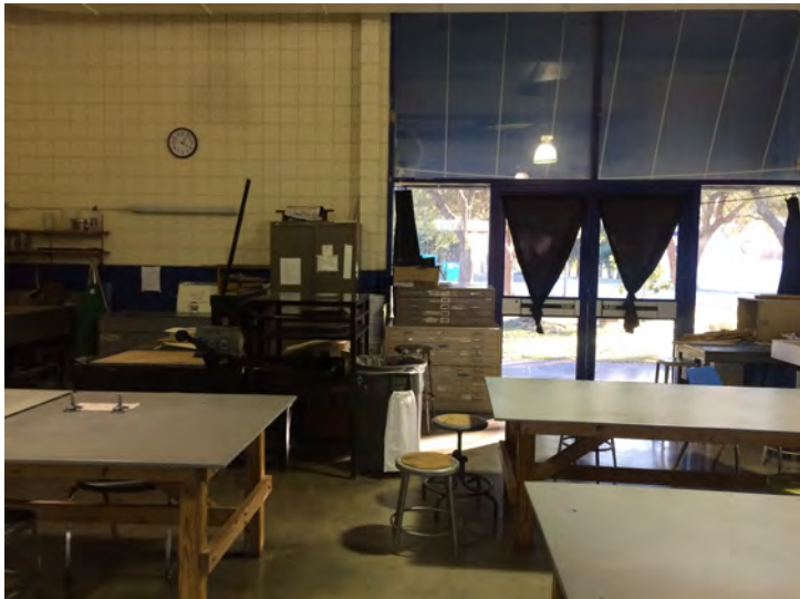
Room 243 Back Wall