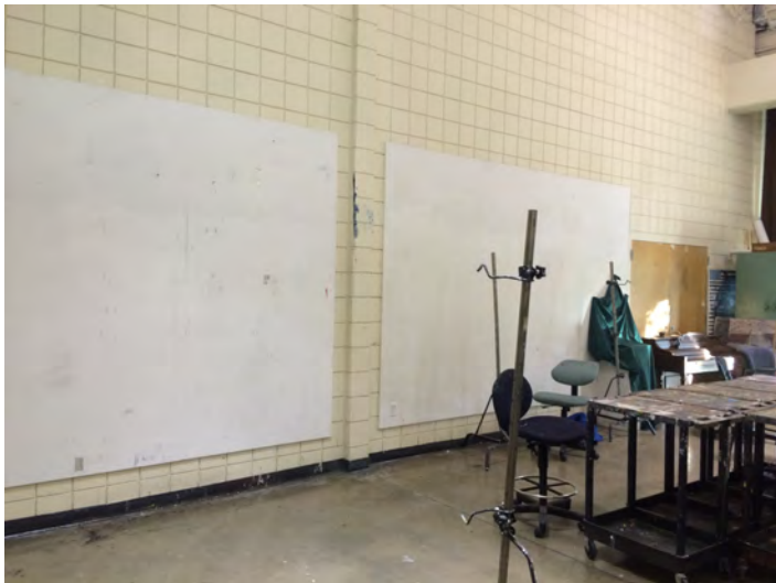
Room 241 Left Wall