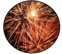
End of Session A