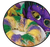
Mardi Gras Celebration