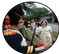
Historic Pensacola Field Trip