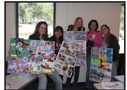
IEP students show off their Vision Boards

I encourage you to create a Vision Board and experience the excitement and results!!!!